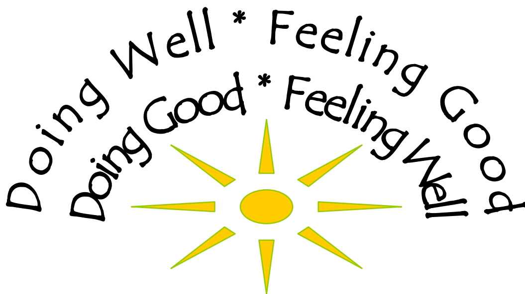
Figure 1: Conceptualising Wellbeing

‘Doing well - feeling good’ is a fairly common formulation for wellbeing which captures the dual aspect of wellbeing noted above. It is one of the terms used for example by Nic Marks of the New Economics Foundation (Nef), one of the leading think tanks in the UK for advancing ‘wellbeing’ as a policy focus (Marks 2007). ‘Doing well’ conveys the material dimension of welfare or standard of living, suggesting a foundation in economic prosperity, though it need not be limited to this. ‘Feeling good’ expresses the ‘subjective’ dimension of personal perceptions and levels of satisfaction. The second line, ‘doing good – feeling well’, reflects more specifically the findings of our research in developing countries. This made clear that the moral dimension, often bearing a religious expression, was extremely important to people. For many of the people we talked to, wellbeing was not simply about ‘the good life,’ but about ‘living a good life.’ This adds an important collective dimension to subjective perceptions: they reflect not simply individual preferences, but values grounded in a broader, shared understanding of how the world is and should be. At face value, the final phrase, ‘feeling well’ indicates the importance of health to wellbeing. However, it also goes beyond this to an again moral sense about feeling at ease with one’s place in the world – which is critically associated with how one is in relationship to others.